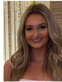
Madeleine Clary Elois Zeanah Endowed Scholarship University of Alabama