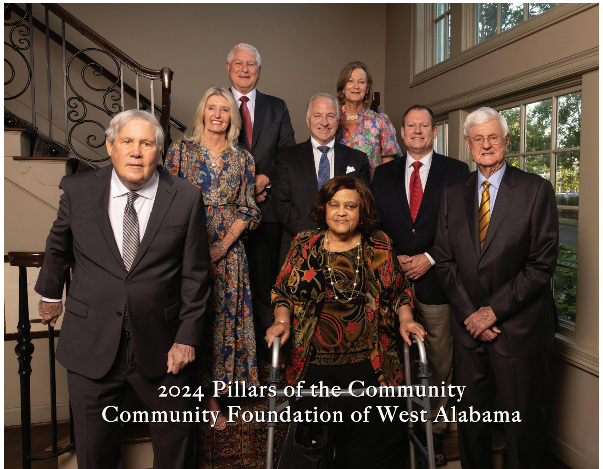
2024 Pillars of the Community Community Foundation of West Alabama

The 20th class of Pillars of West Alabama was recognized on October 10 in a ceremony at Indian Hills Country Club. The Pillars program began in 2004 and except for the COVID pause, has annually honored those of our community that have contributed so much to improving the lives of the citizens of West Alabama.